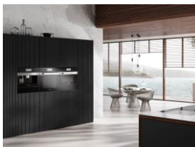
Photo 2: Obsidian black glass fronts with metal handles and stainless-steel trim are key features of Miele built-in appliances in PureLine design. The wall oven (H 7860 BP, centre) sports the TasteControl assistance system, a world first, which prevents food from overcooking. This model also has a camera inside the oven. On the left is a coffee machine with a built-under warmer drawer; to the right a combi steam oven with a vacuum-sealing drawer.