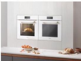
Photo 4: Miele ovens in VitroLine design: The machine handle is in the same colour as the glass front, in this case brilliant white. (Photo: Miele)

Photo 3: As if the oven knew what is coming next: When a user approaches the unit, the oven lighting switches on and the end-of-cycle ringtone is deactivated. The user defines the scenarios to which the machine responds. This application called MotionReact is also available on other built-in appliances from Miele. The photograph shows an oven in ContourLine design. (Photo: Miele)