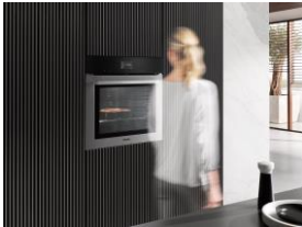
Photo 3: As if the oven knew what is coming next: When a user approaches the unit, the oven lighting switches on and the end-of-cycle ringtone is deactivated. The user defines the scenarios to which the machine responds. This application called MotionReact is also available on other built-in appliances from Miele. The photograph shows an oven in ContourLine design.