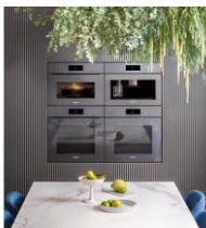
Photo 1: Customers in the market for a handleless kitchen are best served by Miele's ArtLine design line, together with a handleless dishwasher with Knock2open. The machines displayed here are in graphite grey.