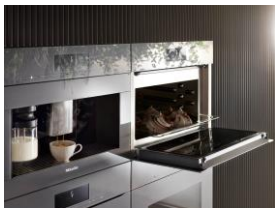
Photo: Exquisite coffee enjoyment prepared in an incomparable way: The CVA 7845 flagship model, shown here beside a compact oven with integrated microwave, has three integrated beans containers and up to 25 different specialities in its repertoire.

Text and photo download: www.miele-presse.de