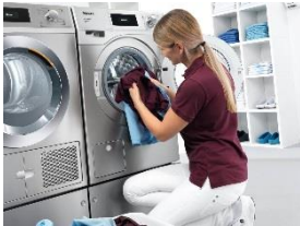
Photo 1: Ample space for a laundry with a small footprint:

A washing machine and dryer from the new generation of Little Giants. Each taking up only half a square meter of floor space, they guarantee clean and dry laundry in only 49 and 38 minutes respectively.