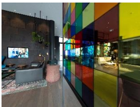
Photo 8: The interior design of the hotel lobby picks up on structures of the nearby Cologne cathedral – with walls of slate and coloured glass modelled on church windows. (Photo: Miele)

Text and photo download: www.miele-presse.de