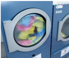
Foto 3: Thanks to their low temperatures, heat-pump dryers go easy on cleaning textiles and cut costs by half compared with vented dryers. (Photo: Miele)

Foto 2: Mops made from microfibre and cotton are used to clean rooms and other areas of the building – depending on the type of floor covering used. The washing machine also have matching programmes for chemothermal disinfection on board. (Photo: Miele)