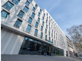
Photo 7: The hotel at Cologne's Neumarkt has 424 rooms. From here, it is only a short walk to the centre of town.