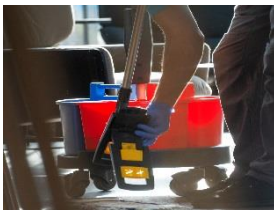
Foto 4: Ready for work on parquet floors: The area in front of the bar is mopped regularly. (Photo: Miele)

Foto 3: Thanks to their low temperatures, heat-pump dryers go easy on cleaning textiles and cut costs by half compared with vented dryers. (Photo: Miele)