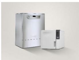
Photo 1: Indispensable for instrument reprocessing in dental surgeries: A thermal disinfectant and a small steriliser from Miele, available to mark the company anniversary with a 125-week Miele warranty.