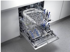
Photo 3: A space-saving solution for the hoses used in sedation with nitrous oxide in a Miele thermal disinfectant. If needed, 44 injector nozzles are also available for the reliable internal cleaning of lumened instruments.

Text and photo download: www.miele-press.com