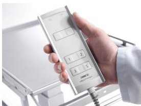
Photo 2: The ATT 86 trolley is operated using an easy-to-use handheld set of controls. The height-adjustment feature allows employees of different stature to reach the upper rack levels with ease. (Photo: Miele)

Photo 1: Highly efficient laboratory glasswashers from Miele's PLW 86 series. They have proved their worth above all in large laboratories and is flexible in use thanks to the EasyLoad system. (Photo: Miele)