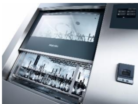
Photo 1: Highly efficient laboratory glasswashers from Miele's PLW 86 series. They have proved their worth above all in large laboratories and is flexible in use thanks to the EasyLoad system.